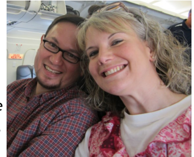
En route to St. Petersburg, FL for the GARBC Annual Conference