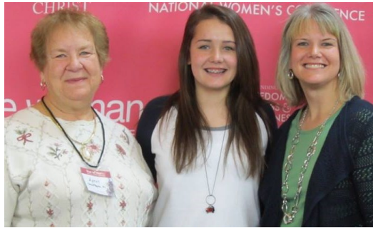
The Ladies at the True Woman Conference in Indianapolis